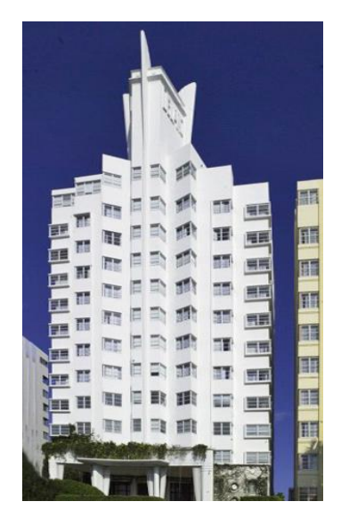
The Delano Hotel South Beach (Miami), FL