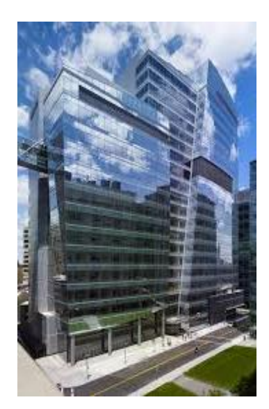
The Center for Life Sciences Boston, MA